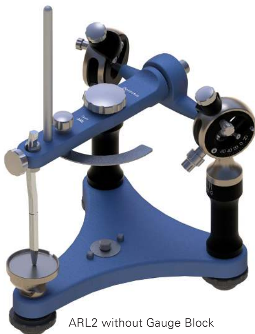
ARL2 without Gauge Block