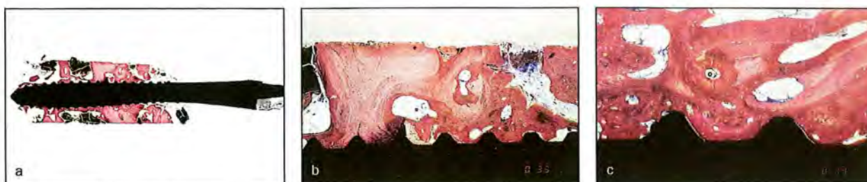
Figs 3a to 3c Photomicrograph of the TI and surrounding bone (Stevenel's blue and Van Gieson's picric fuchsin; original magnification \times 2 ). The TI functioned for 8.5 months in the mandibular right second molar area of the patient in Fig 1 (Stevenel's blue and Van Gieson's picric fuchsin; original magnification \times 2 for b and \times 4 for c).