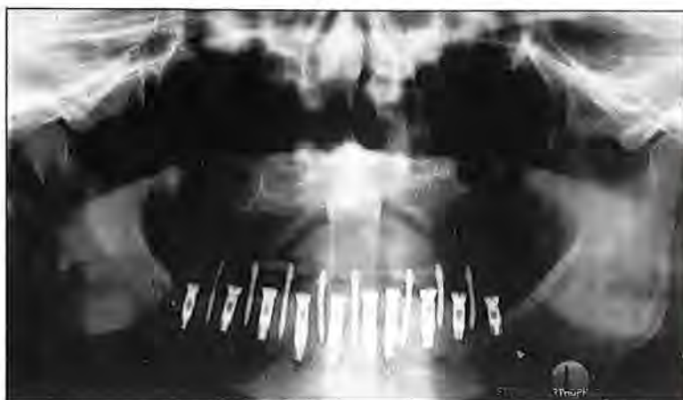
Fig 1a (Left) Radiograph of TIs supporting a fixed provisional prosthesis while the restorative implants are healing without loading.