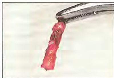
Fig 2a (Left) Removal of a TI with a trephine.