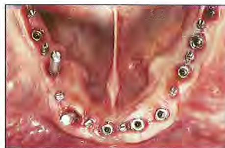
Fig 1b (Below) The TIs and restorative implants.

the use of transitional implants (TIs) to support a fixed provisional prostheses. The serial extraction technique is a method in which strategically located hopeless teeth are temporarily retained across the arch to support fixed provisional prostheses during implant healing. 3 This method avoids transmucosal loading of the implants and allows the patient to function with a fixed provisional prosthesis during the time of implant healing and restoration. However, a second surgical phase, additional extractions, and implant placement are required following the initial implant healing and loading. This "serial approach" adds a minimum of 6 months to 1 year to the treatment time prior to the seating of the definitive restoration. The additional treatment time often results in loosening of the remaining abutment teeth, and also increases the risk of loosening and fracture of the provisional prostheses. This, in turn, increases the time and the cost of the entire treatment. 3