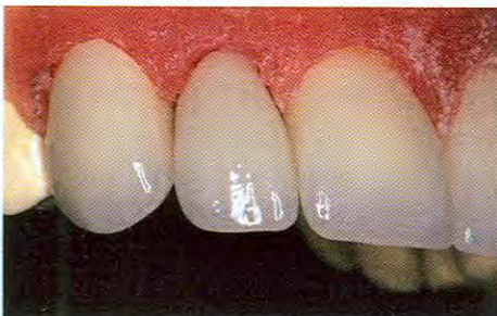
FIGURE 26 Laboratory view of the pressed ceramic coping and final all-ceramic restorations.