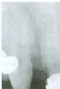
FIGURE 16 Preoperative digital periapical radiograph showing narrow intertooth space.