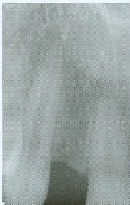
FIGURE 3 Preoperative digital periapical radiograph demonstrates limited intertooth space.