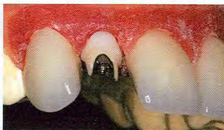
FIGURE 25 View of the laboratory cast with pressed ceramic coping.