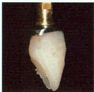
FIGURE 21 Flowable composite was placed around the margins of the coping to correct the marginal integrity.