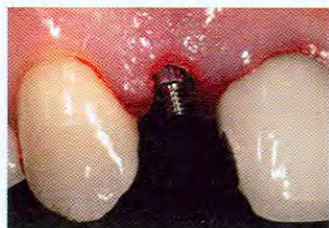
FIGURE 19 Flapless implant placement was accomplished at the No. 7 site.