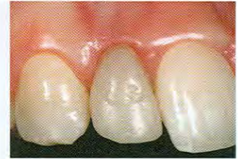
FIGURE 11 At the three-month postoperative appointment, excellent soft tissue contours were realized interproximally.