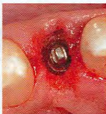
FIGURE 6 Minimally invasive bone grafting was achieved by making a pouch at the buccal aspect of the site.