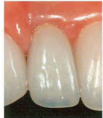
FIGURE 14 Close-up view of the implant-supported restoration.

which prevented balance between the facial height of contour of the edentulous site and that of the left lateral incisor space.