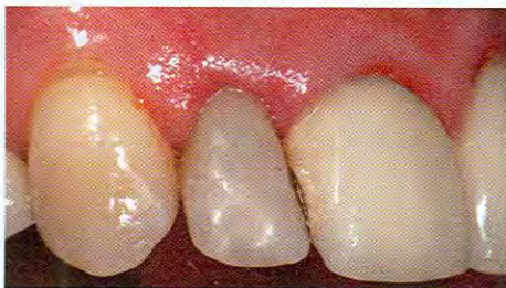
FIGURE 24 At two weeks postoperative, excellent soft tissue contours had developed.