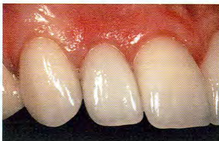
FIGURE 27 Final postoperative view of the restored right lateral incisor.