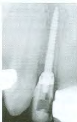
FIGURE 23 Immediate postoperative digital periapical radiograph.

of a surgical guide a , the initial coring was accomplished with the 1.2-mm spade drill using a flapless technique. A 2.2 mm in diameter by 10 mm in length implant was inserted, also using a flapless technique (Figure 19).