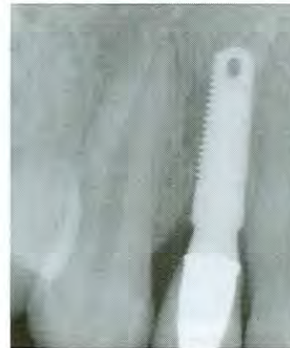
FIGURE 13 View of the digital radiograph of No. 7 upon completion of the case. Note the contoured emergence profile of the osseous crest, which was sculpted at implant placement and is supporting the interdental soft tissue contours.