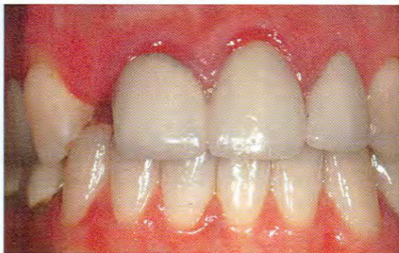
FIGURE 15 Preoperative facial view of a patient presenting with a congenitally missing right lateral incisor.