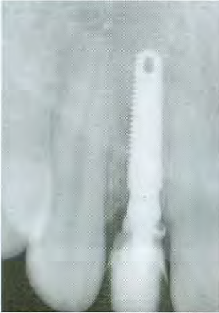
FIGURE 9 Immediate postoperative digital periapical radiograph.

facial emergence profile. The implant and abutment collar were confirmed to be in the appropriate position (Figure 5).