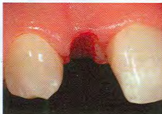
FIGURE 4 The sculpted crestal emergence profile was necessary to achieve balance and symmetry.