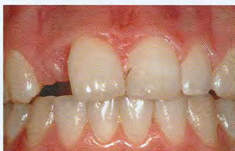
FIGURE 1 Preoperative facial view of a patient with a congenitally missing right lateral incisor.

After gathering maxillary and mandibular study models and a facebow transfer, the fabrication of a diagnostic wax-up of the maxillary anterior sextant was accomplished. From this diagnostic wax-up, which outlined the planned facial tissue heights of contour and dimensions for the final restorations, a surgical guide/provisionalization system a was constructed. This guide was used as the surgical stent and, after the implant