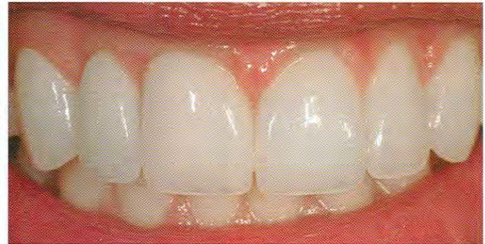
FIGURE 12 Complete facial view of the final case, which includes the final restoration at site No. 7, as well as veneers on teeth Nos. 6 and 8.