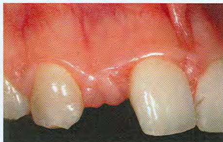
FIGURE 2 Preoperative close-up view of the right lateral incisor space.