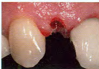
FIGURE 18 An ovate pontic emergence profile was created.