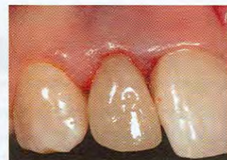
FIGURE 8 Immediate postoperative clinical view of patient with the provisional in place.

was seated, was converted to the provisional restoration seated at the implant placement appointment.