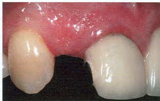
FIGURE 17 Preoperative close-up view of the edentulous space.