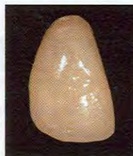
FIGURE 7 View of the final provisional restoration.