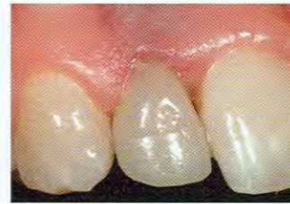
FIGURE 10 View at seven days. Note that the soft tissue contours were developing.

A 31-year-old non-smoking female patient presented for esthetic enhancement of the maxillary dentition and replacement of the congenitally missing right lateral incisor (Figure 15). The preoperative digital periapical radiograph (Figure 16) clearly showed the narrow intertooth space. The pretreatment view of the edentulous space (Figure 17) showed the lack of a sculpted emergence profile,