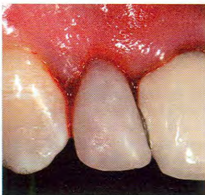
FIGURE 22 Immediate postoperative clinical view with the provisional in place.