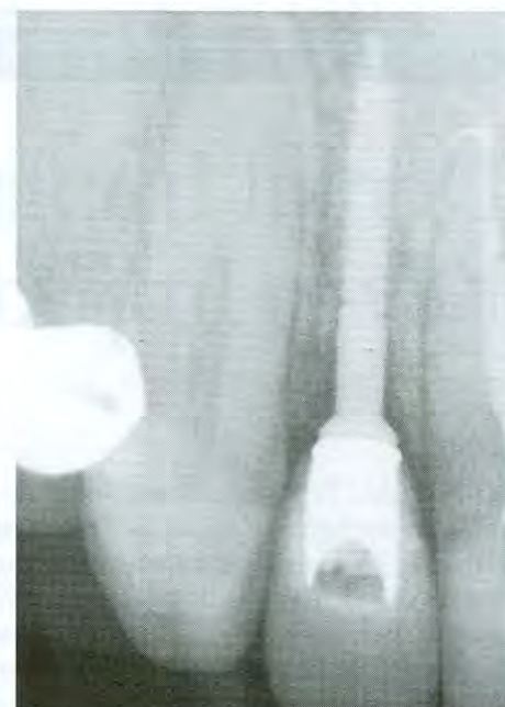
FIGURE 28 Digital periapical radiographic view upon case completion.

of dental implants, without preparation and/or reduction of the adjacent natural dentition. Proper placement procedures and restorative techniques can lead to very esthetic results, allowing for natural tissue contours and emergence profile formation that are reminiscent of the natural tooth.