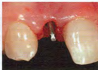
FIGURE 5 View following minimally invasive implant placement. Note the position of the abutment portion in relation to the sculpted emergence profile in the gingival/crestal tissue.