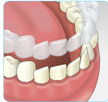
Clear Aligner Treatment