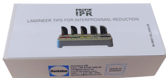
Assorted Tip Kit LTA-P/SK2