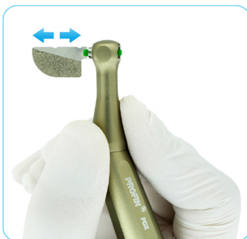
Profin PDX with IPR Tip