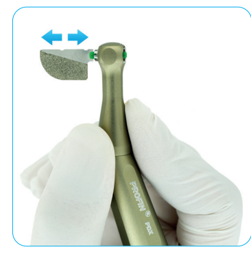
Profin PDX with IPR Tip

The solution consists of Interproximal Reduction (IPR) tips together with the reciprocating Profin PDX handpiece.