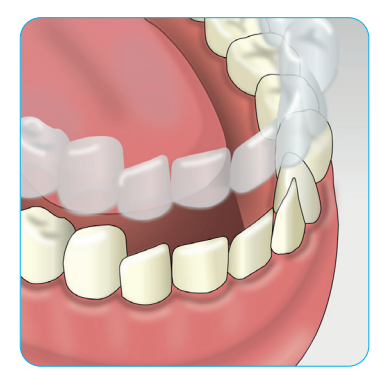
Clear Aligner Treatment

Calibrated blade thickness from 0.1 mm to 0.5 mm Long lasting tips Autoclavable