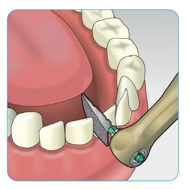
IPR in Align Orthodontics